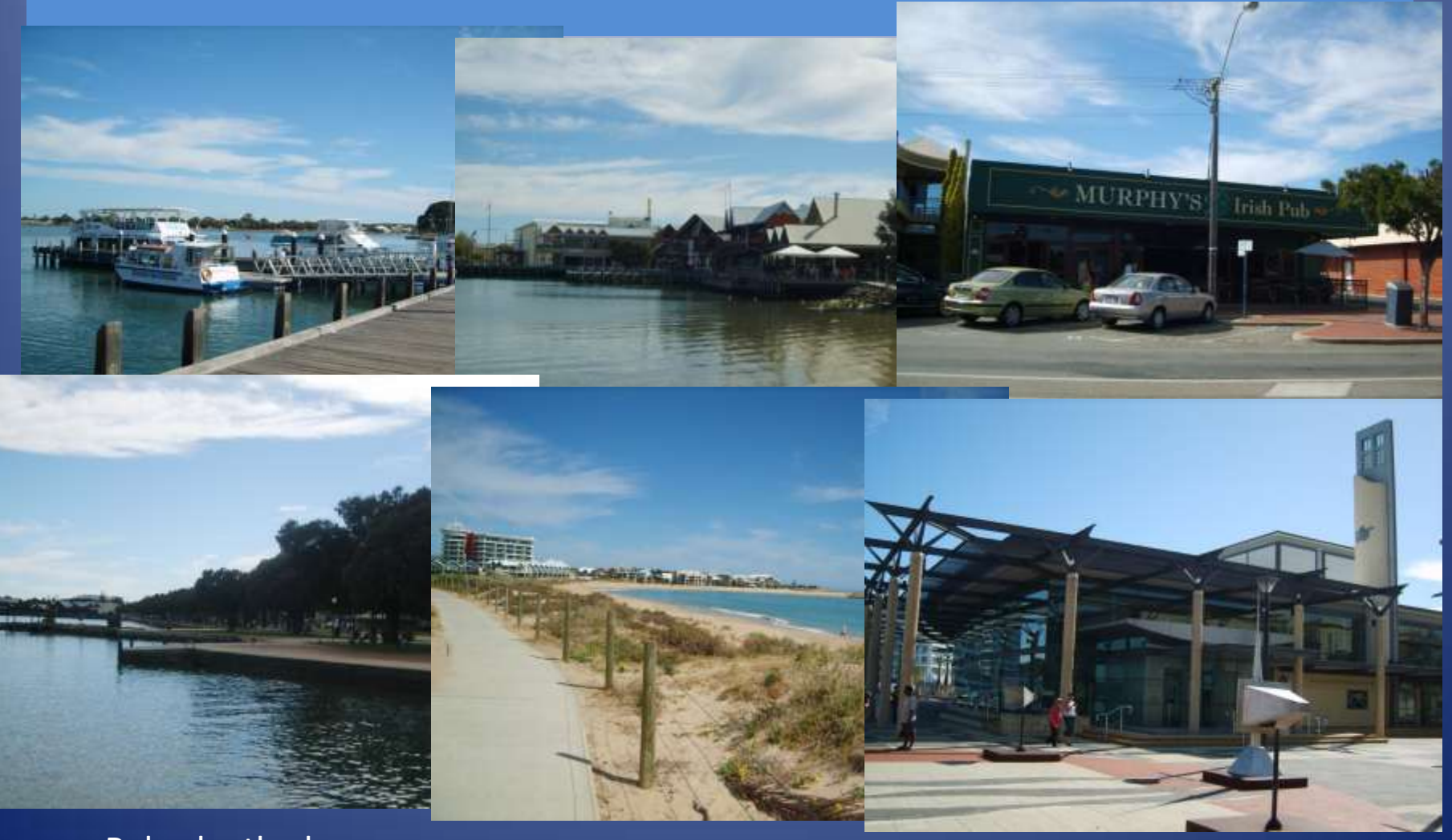
Relax by the lagoon