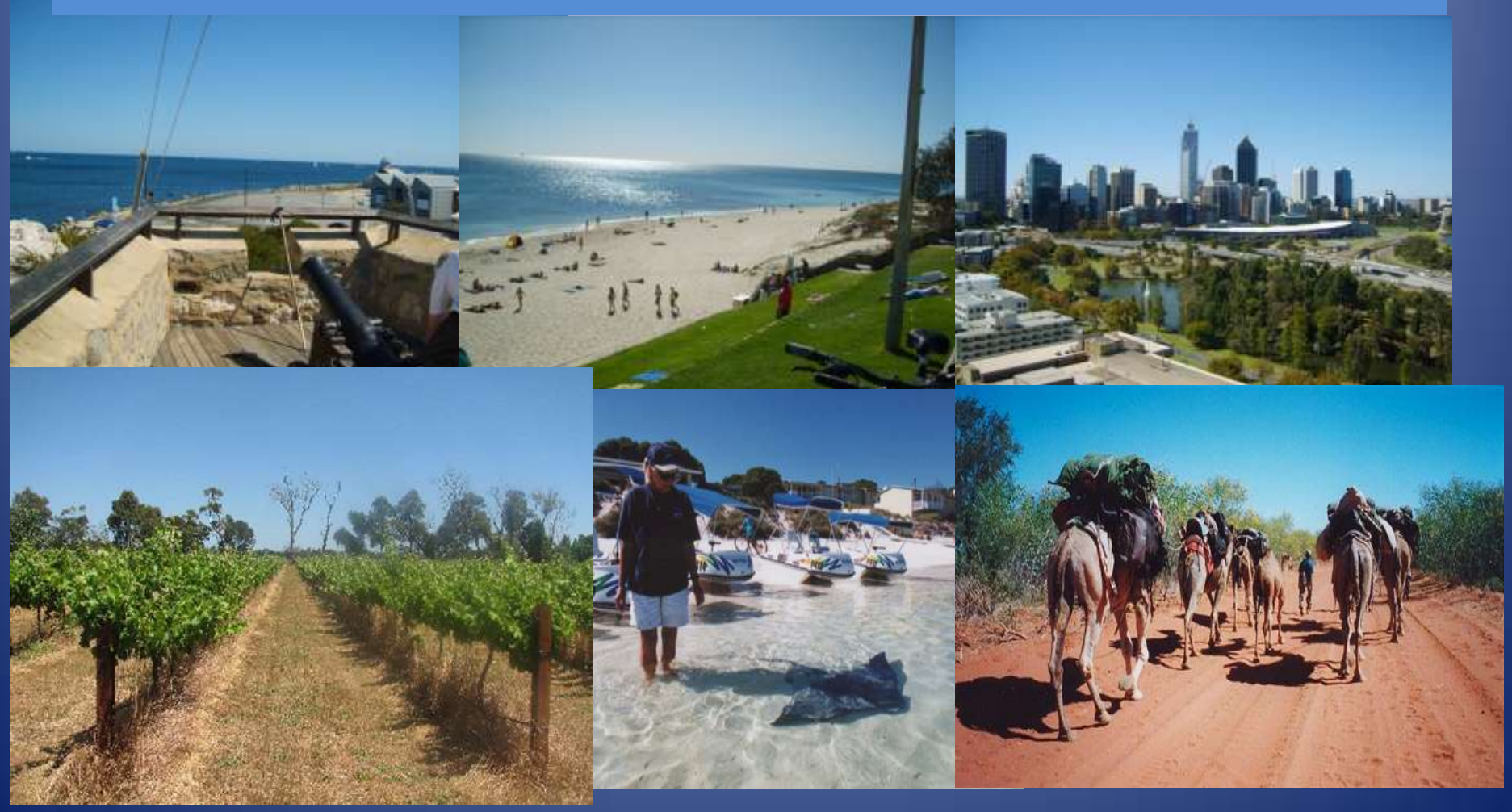
Margaret River Vineyards