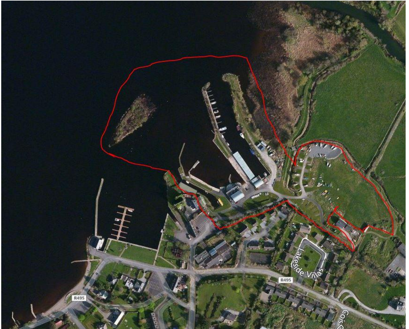
Lough Derg Yacht Club. Dromineer.